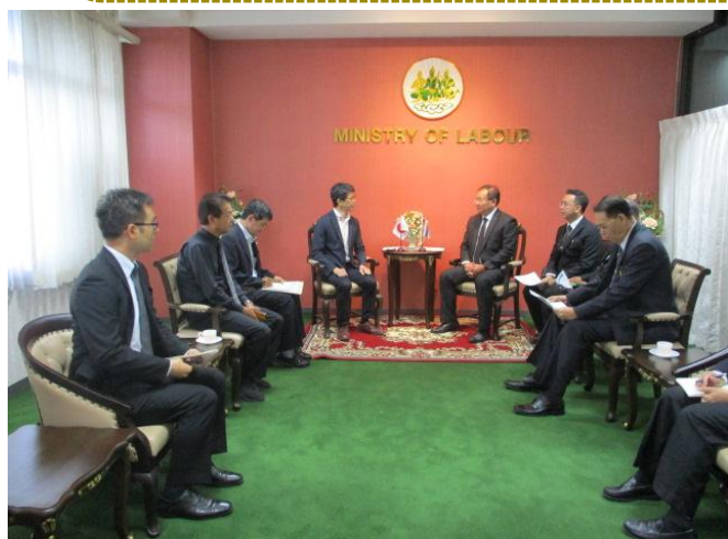
The consultation with a deputy secretary in department of labor in Thailand