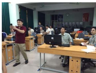
Scenery of Training

Vietnam set a goal to industrialized till 2020, is tackling of advanced human resources cultivation. We has been carrying out the continuous support for the strengthen cultivation function of vocational training instructor and development of vocational ability evaluation system by JICA program one of support on such a human resources development field. At SESPP is supporting the introduction of Japanese skill testing to national trade skill testing and certification in cooperation with JICA program. So far Japanese skill testing was adopted on some job grade like a Lathe, it will be scheduled to formally adopting as a national certification in the future.