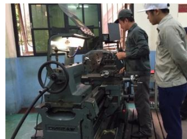
Scenery of Training