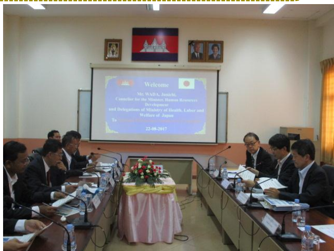
The consultation at core training facility in Cambodia(NPIC)