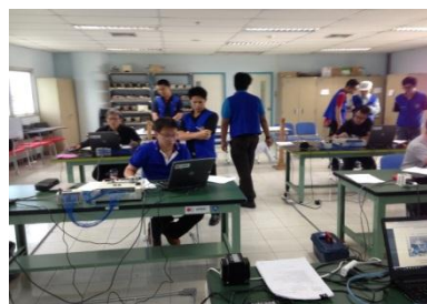
Scenery of Training

Level of satisfaction about the training from attendees was very high and there was impressions like "It helps to lead to next step", "We would like to take a look how national trade skill testing & certification is going by video in Japan" Also, from the instructor contributed a powerful message "There was some differences of whole skills and level of understandings of trainings between participants, but this skill testing program indispensable for automation of companies related to automobile in Thailand, definitely should make a success. One who finishes are planing to participate as assessors at skill evaluation trial which is carrying out like an actual national trade skill testing & certification, aim to acquire of skills that be able to become a independent as an assessor.