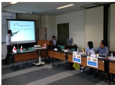
Announcement of Country paper

There was some different in participant's English skills at the beginning, there was a difficult scene for communication between the members, Eventually they were undertaken collaboratively in good teamwork and eagerly to the trainings. From instructors, numerous comments of wishes for their success that the content of created action plan this time would be able to be a good use for the vocational trainings of each countries after returning to home.