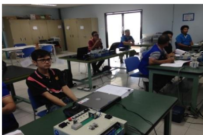
Scenery of Training

SESPP in Thailand, AHRDA which is a organizer of automobile related skill's human resources cultivation as a core institution is proceeding, was conducted skill evaluated course of Sequence Control level 2 on 22th to 25th of August. Under the guidance of dispatched 2 experts from Japan, 10 attendees are divided to assessor and examinee and had alternately role-playing exercises.