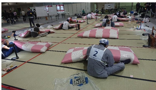
Japanese Duvet and Cushion Making