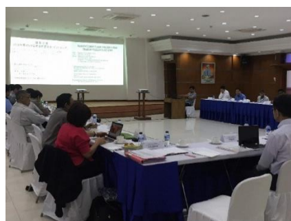
Public-Private Joint Committee meeting