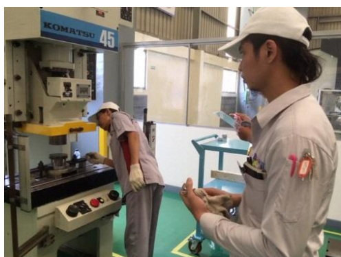
Practical exam forming by press machine)