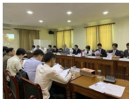
Public-Private Joint Committee meeting