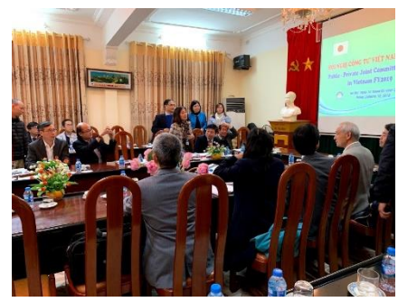
Public-Private Joint Committee meeting