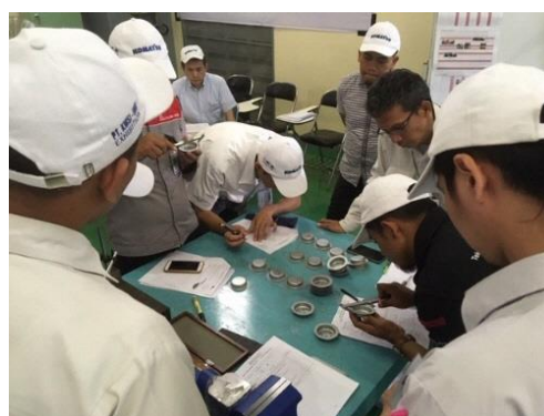
Scoring by Skills Assessors

Publisher : Secretariat of SESPP ( JTB Corp. Kasumigaseki Branch )