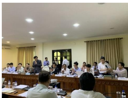
Opening remarks by Ministry of Labor and Vocational Training