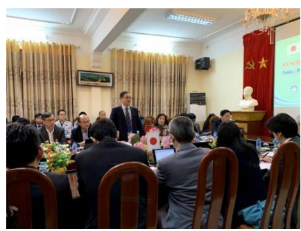
Opening remarks by the Ministry of Labour - Invalids and Social Affairs