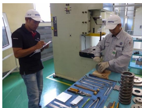
Skills Assessor operating the practical exam