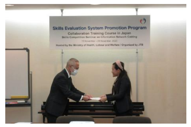
November 25<sup>th</sup>: Closing Ceremony