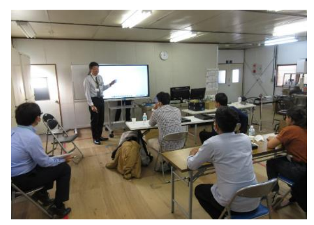
November 22<sup>nd</sup> - 24<sup>th</sup>: Skills Competition Seminar