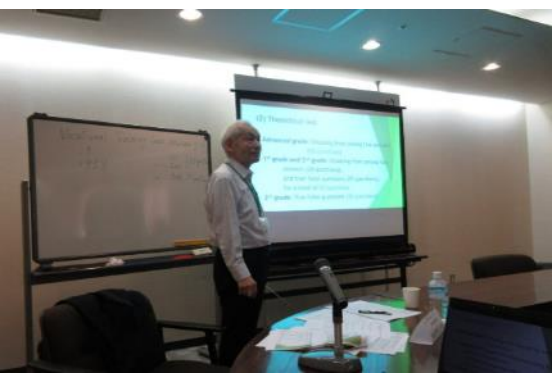
November 16th: Overview of skills test and skills competition in Japan