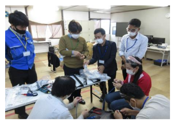
November 22<sup>nd</sup> - 24<sup>th</sup>: Skills Competition Seminar