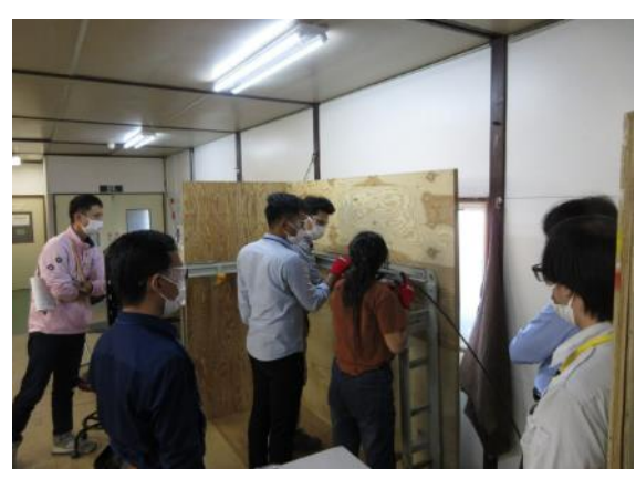
November 22<sup>nd</sup> - 24<sup>th</sup>: Skills Competition Seminar