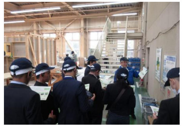
November 21st: Polytechnic Center Chiba