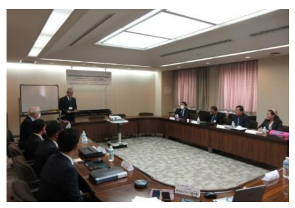
November 25<sup>th</sup>: Closing Ceremony