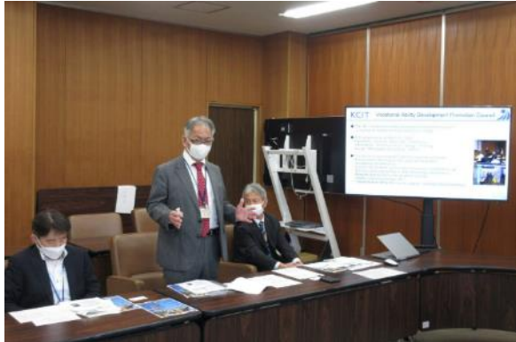
November 21<sup>st</sup>: Kanagawa Prefectural Industrial Technology College