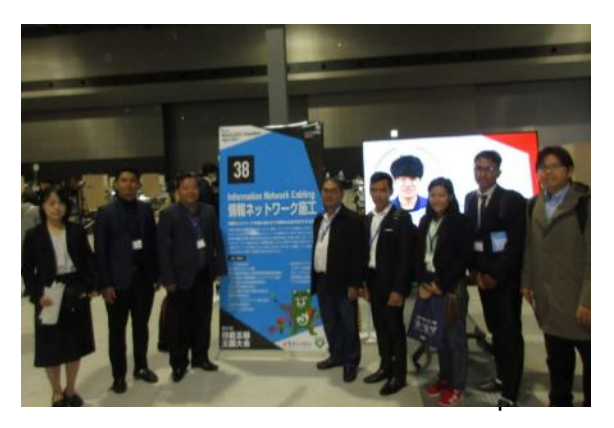
November 18th-19th: National Skills Competition