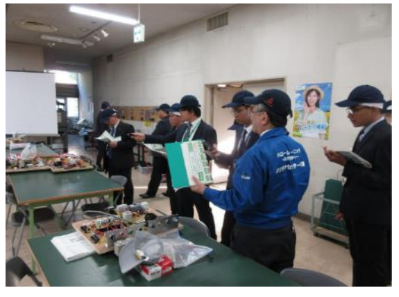
November 21st: Polytechnic Center Chiba