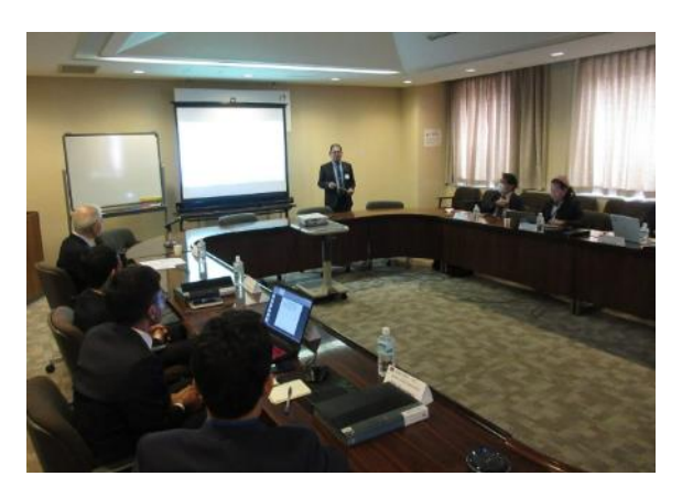
November 25th: Action Plan Presentation