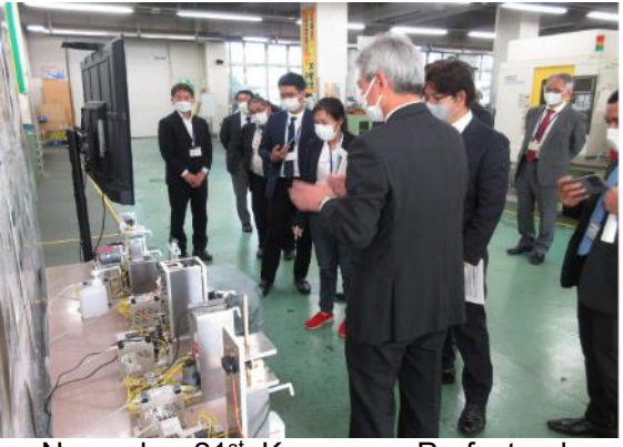
November 21<sup>st</sup>: Kanagawa Prefectural Industrial Technology College