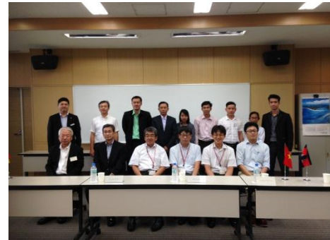
Photography of Participants