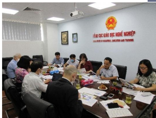
Annual Consultation Meeting (Vietnam)