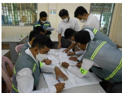
Practical test operation by assessors