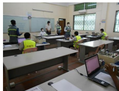
Practical test operation by assessors